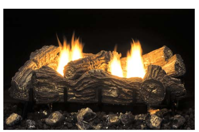
DST Vent Free Gas Logs - Side B